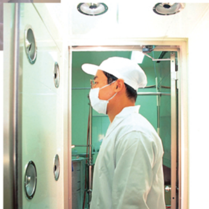
以先進無菌室把關、使產品達到零污染 A bacteria-free room is used to insure that the product is not contaminated.