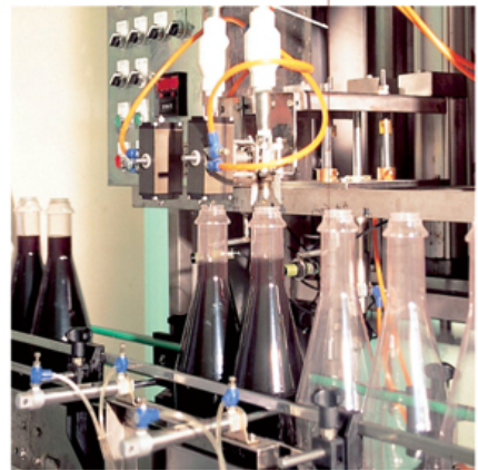
提昇產品水準、自動化處理。 Automated handling continues to insure the products quality.