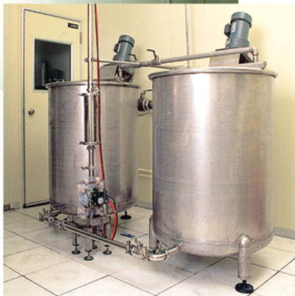
自動化攪拌桶，使產品成份均勻。 Automatic stirring machines are used to distribute the ingredients evenly.