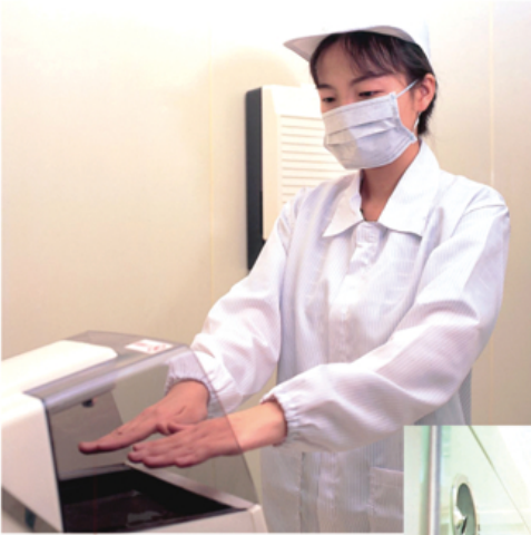
工作人員嚴格消毒處理。 The workers sterilize their hands before beginning work.

" Jin Fang Chuan Biotechnology Co. Ltd. " is proud of its excellences in the new technological development of manufacturing and research to maintain the hygiene and the supreme flavor. Providing natural and healthy products by our prime biotechnology and automatic facilities is to achieve customers' enjoyment and satisfaction.