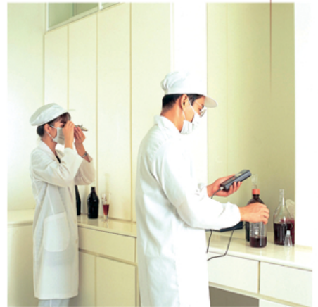
檢驗人員嚴格的品管控制。 inspectors strictly control the quality of the product.